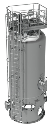
Hydrophore Water Vessel

Every system can be customized, upon request, for compliance with both applicable rules or regulations and project specific requirements. Full documentation for any tailor-made products are available and include all necessary certifications, third party verifications such as DNV/GL, BV, ABS, etc., and full scale test reports, if required.